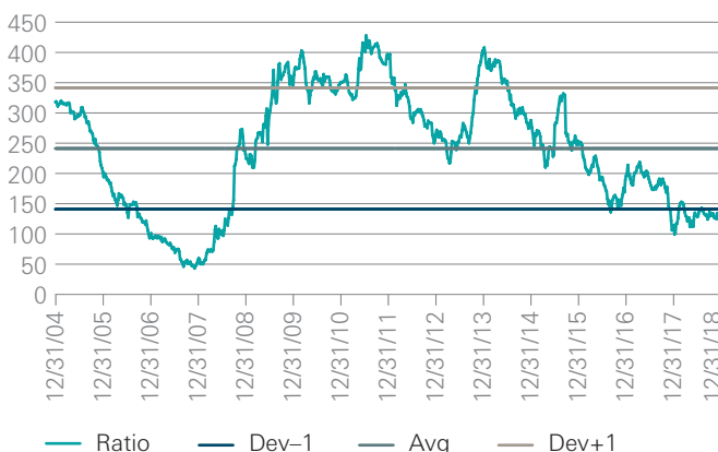
FIGURE 4: 2/30 AA CURVE IS RELATIVELY FLAT

May not be indicative of future results. Standard deviation (dev) is often used to represent the volatility of an investment. It depicts how widely an investment's returns vary from the investment's average return over a certain period.