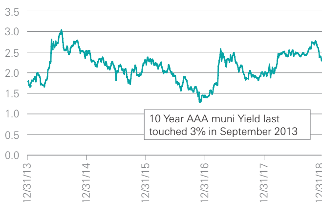
FIGURE 1: 10YR AAA YIELD 2013–2018

Source: Thomson Reuters (As of 12/31/18). Past performance may not be indicative of future results.