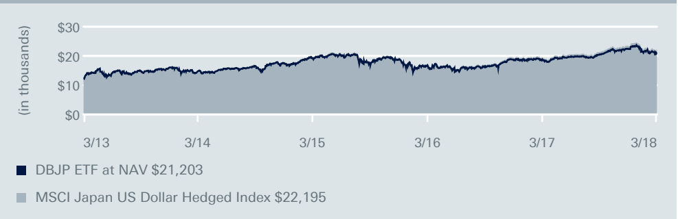
ETF performance and index history (from 3/31/13 to 3/31/18)

Includes reinvestment of all distributions.