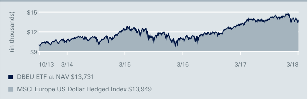
ETF performance and index history (from 10/1/13 to 3/31/18)

Includes reinvestment of all distributions.