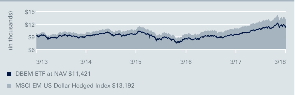
ETF performance and index history (from 3/31/13 to 3/31/18)

Includes reinvestment of all distributions.