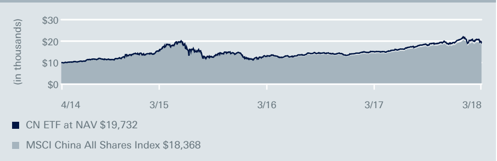
ETF performance and index history (from 4/30/14 to 3/31/18)

Includes reinvestment of all distributions.