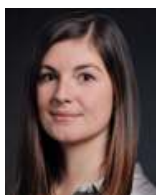
Rosie Hunt Property Market Research

This information is subject to change at any time, based upon economic, market and other considerations and should not be construed as a recommendation. Past performance is not indicative of future returns. Forecasts are not a reliable indicator of future performance. Forecasts are based on assumptions, estimates, opinions, and hypothetical models that may prove to be incorrect. Investments come with risk. The value of an investment can fall as well as rise and your capital may be at risk. You might not get back the amount originally invested at any point in time. Source: DWS International GmbH.